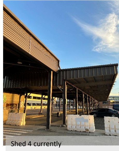
Shed 4 currently

Eastern Market Development Corporation (EMDC) is seeking a construction manager to lead the construction of a new signature shed in the Eastern Market District. The goal of this Request for Qualifications (RFQ) is to vet a selection of construction managers that meet the qualification criteria to then submit a bid to deliver a timely, cost-effect new Shed 4.