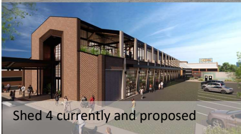
Shed 4 currently and proposed