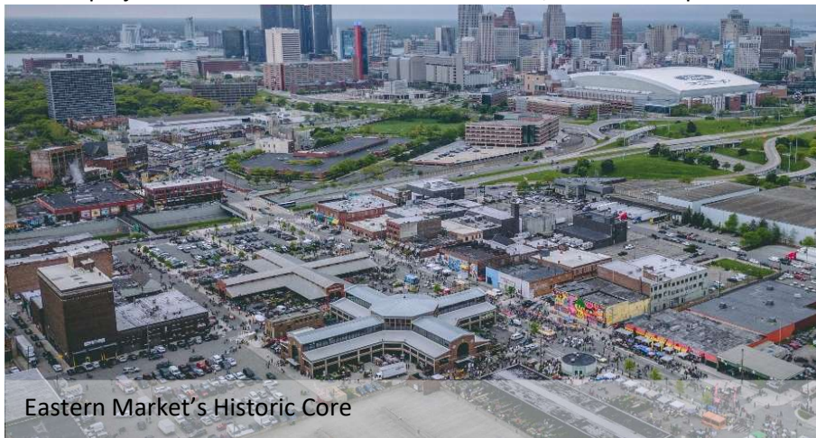
Eastern Market's Historic Core

EMDC has completed 2 commercial renovations in the district: the $5M Metro Accelerator project and the $17M renovation of Shed 7, a wholesale produce distribution facility.